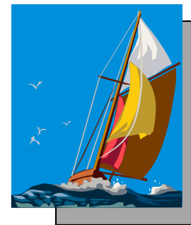
Let God be your rudder.

God knows how to move you when the time comes for you to be moved. He knows what is happening to you and what should be happening for you. In other words, trust God to be God.