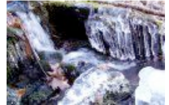
Did the Ice Age finish off the dinosaurs?

So, in closing this “Christian Guide to Dinosaurs,” we will explore the possibility that dinosaurs and other dinosaur-like animals (i.e. pterosaurs) have survived into present times. We approach this with some caution, as much of the evidence consists of eyewitness accounts. However, such reports have a history that makes them worth considering.